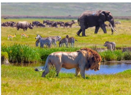
The Serengeti National Park

Tanzania is well known for the majestic spice Islands of Zanzibar, the ultimate paradise on the Indian Ocean; Mount Kilimanjaro, the highest mountain in Africa with a snow cap despite being very close to the Equator; the Olduvai Gorge – the Cradle of Mankind; the Ngorongoro Crater – the 7th natural wonder of the World; the Serengeti National Park – world renown for the largest concentration of wildlife and the spectacular wildebeest migration (there is nothing like it on this planet); the Selous Game Reserve – the largest game reserve in Africa; Lake Tanganyika – the deepest lake in Africa; and Lake Victoria, the largest lake in Africa. All these endowments offer opportunities for leisure and investment in hotels, camps, water sports, hunting, and tour operations.