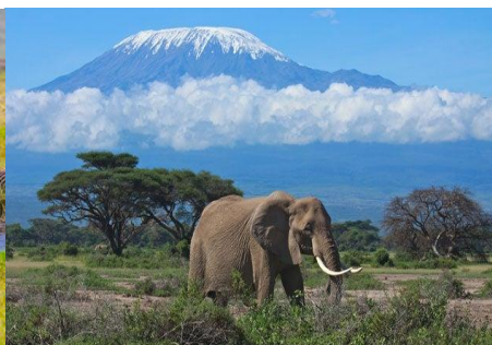
The Kilimanjaro Mountain