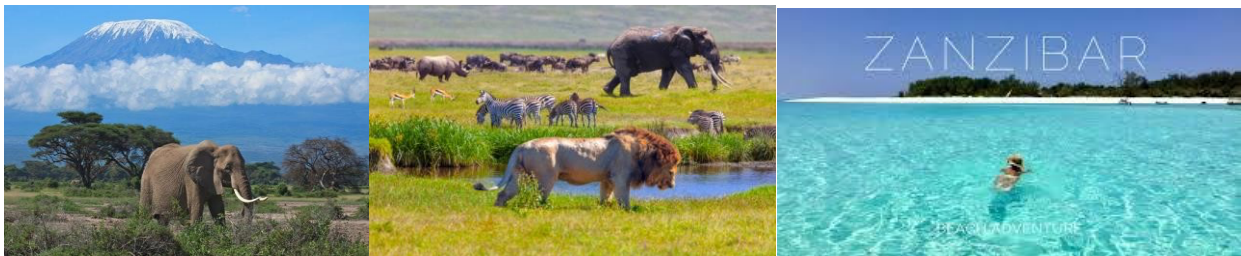
The Kilimanjaro Mountain the Serengeti National Park Zanzibar

Tanzania is well known for the majestic spice Islands of Zanzibar, the ultimate paradise on the Indian Ocean; Mount Kilimanjaro, the highest mountain in Africa with a snow cap despite being very close to the Equator; the Olduvai Gorge – the Cradle of Mankind; the Ngorongoro Crater – the 7th natural wonder of the World; the Serengeti National Park – world renown for the largest concentration of wildlife and the spectacular wildebeest migration (there is nothing like it on this planet); the Selous Game Reserve – the largest game reserve in Africa; Lake Tanganyika – the deepest lake in Africa; and Lake Victoria, the largest lake in Africa. All these endowments offer opportunities for leisure and investment in hotels, camps, water sports, hunting, and tour operations.